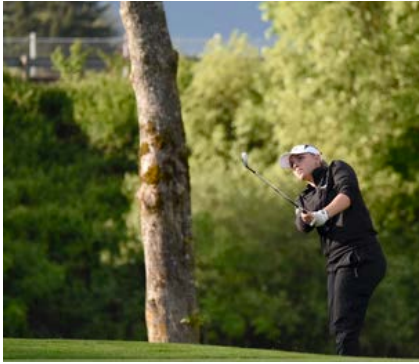
Girls Golf 4 th in District