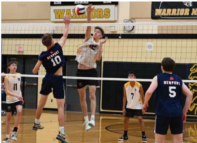
Boys Volleyball Finishes league tied for 1 st Place