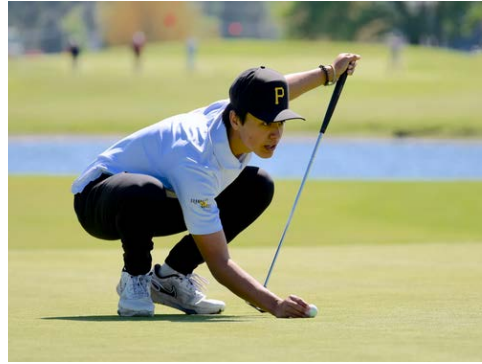
Boys Golf 5 th in District