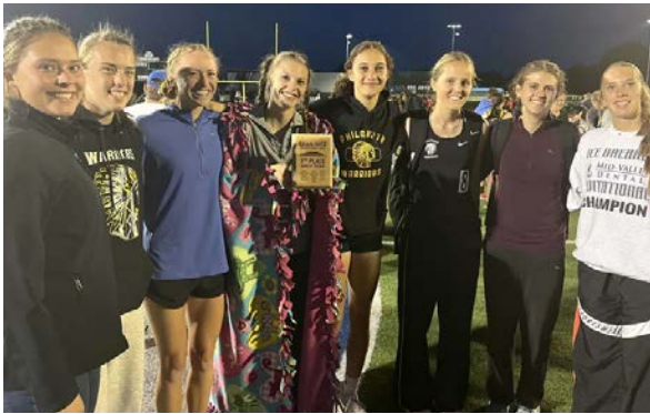
Girls Track and Field finishes 3 rd place at large school meet