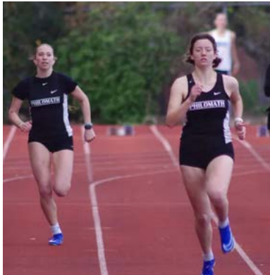
Our Girls Track and Field Team finished in 3 rd place in the Vic Downs Invite in McMinnville.