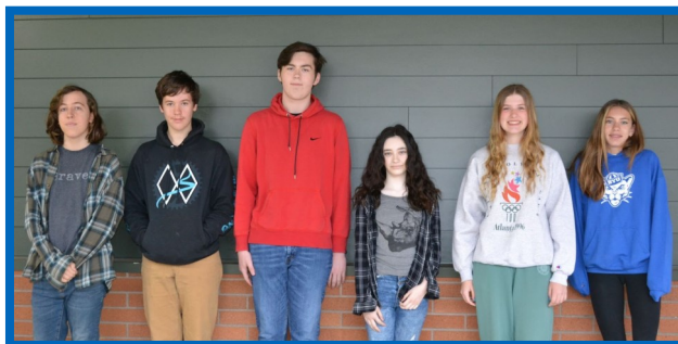
April Students of the Month

May 13.....No Student Day May 17 .....Choir Concert @ PHS 6:30PM May 18 .....Band Concert @ PHS 6:30PM May 27 .....No School- Make up day May 30 .....No School—Holiday May 31 .....Incoming 6th Grade Orientation